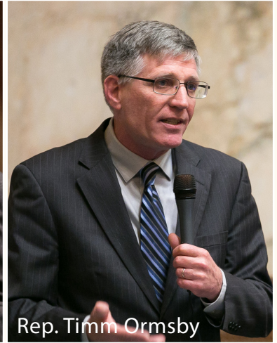
Rep. Timm Ormsby